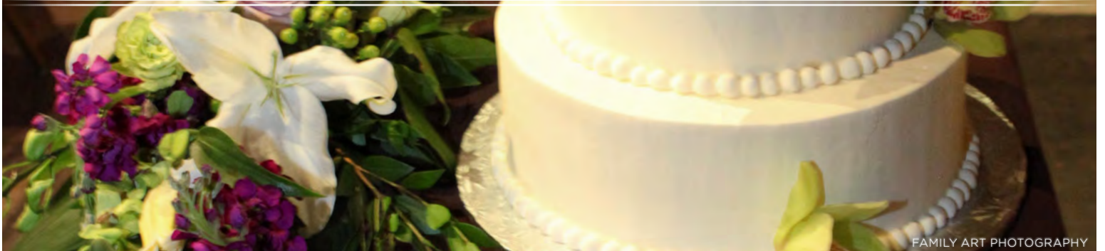
FAMILY ART PHOTOGRAPHY